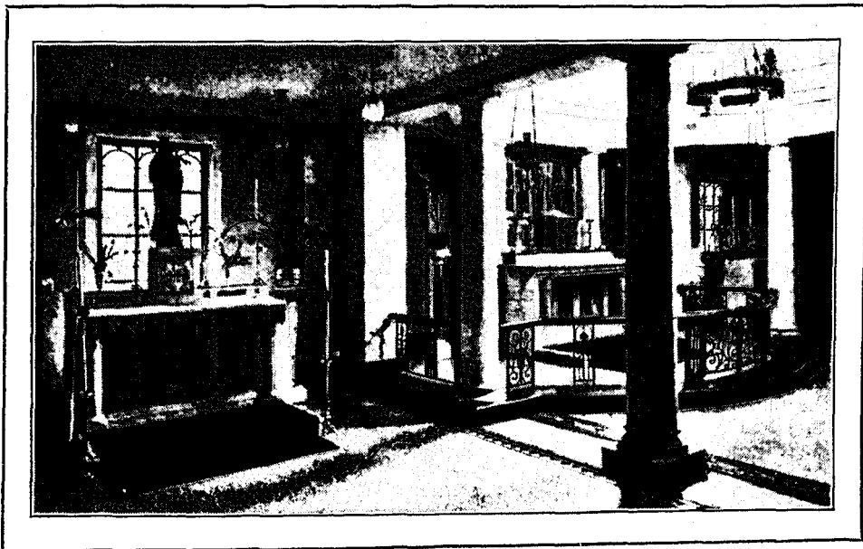
The Chapel (The Three Altars).

We sincerely hope that the necessary funds (about £20,000) will be forthcoming. The patroness is Her Majesty